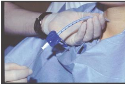
Portex minitracheostomy (Smiths Medical, Code 100/461/000)