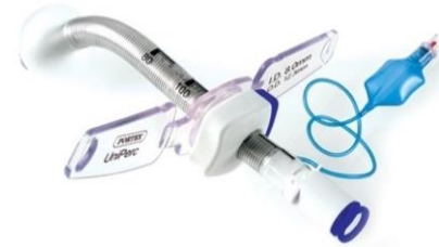
Uniperc® tracheostomy tube