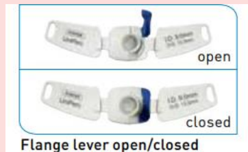
Flange lever open/closed

Measure and record external tube length from Tracheostomy hub in mm